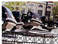
Myrtle Beach Photos